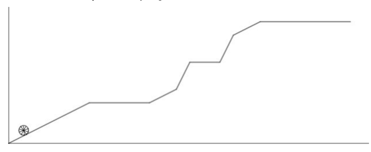
My Gears (not to scale):

I've done this hill like 5 times, and every time my chain has broken and I've had to make a new one out of it. I just want my original back.